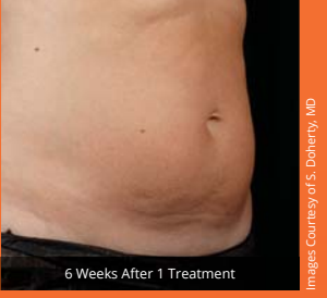
Flanks and Abdomen